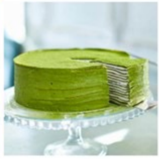
Fit for The Queen

A good pudding is made with passion and pride, so we'd love to hear the story behind your entry. Perhaps the recipe was inspired by Her Majesty The Queen's life, has been handed down through the generations of your family, or recalls one of your own special memories.