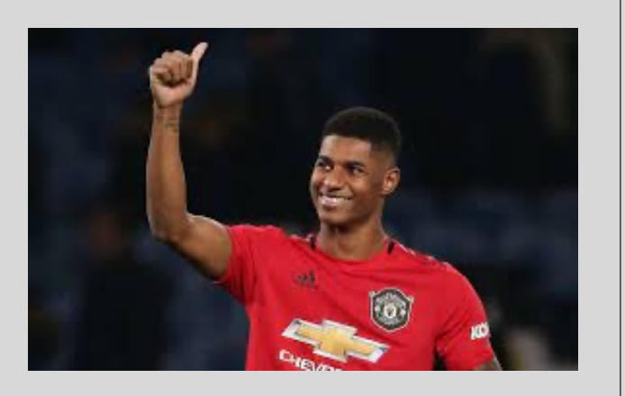
Who are these role models for?