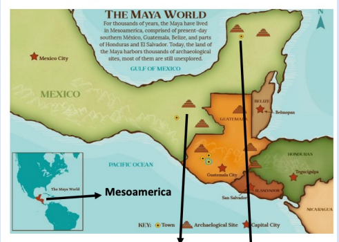
Famous Mayan cities include Palenque and Chichen Itza , which are found in Mexico.

Tikal not far south of El Mirador that also was an early site and by the Late Classic become a metropolis of over 60,000 people. Tikal had several large pyramids one rising 47 metres high! It is called the Temple of the Great Jaguar and housed the tomb of King Jasaw Chan K'awiil.